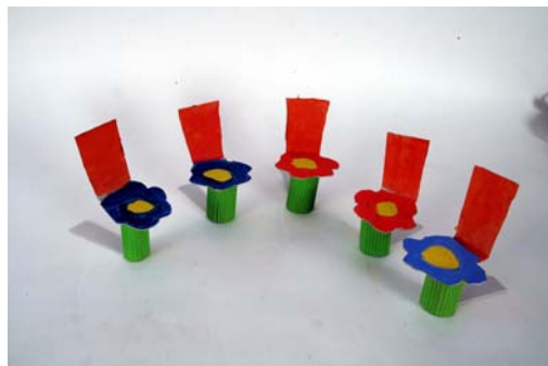
Model for « ronde de fleurs », season 1.