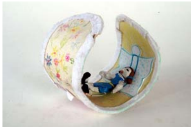
Model and final prototype for Babycool , season 2