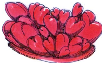
Drawing for « Cœurs en fête », season 1.

In view of the highly educational nature of the entire project, the mudac has decided to integrate a certain number of educational “flower-games” into the exhibition. These offer additional information about furniture making: function, form, colour, material, message, etc. Basically, what is being done at the mudac is the opposite of the MobiDécouverte process: from the final exhibited object, the visitor – child or adult – is sent back to the conception phase.