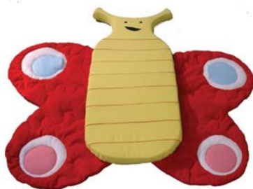
Prototype for « Petit voyageur », season 2.

The whole operation testifies to the enrichment of the children but also to that of the adults who accompany them in observing the framework of their lives, in becoming aware of their universe. Their models emphasise the way in which they see the environment that adults design for them. The manner in which they use materials, shapes and colours expresses their wishes, certainly, but also their discernment. Their rejection of the superfluous and their need for functionality reflect their critical minds and their level of demand. Free from all constraints, including economic ones, the children's "creations" do not remain any less lacking in naivety. They were able to appropriate and take into account the various creative parameters for functional, aesthetic productions that match their needs and their dreams. Dreams that they have had the talent to name with a great deal of humour!