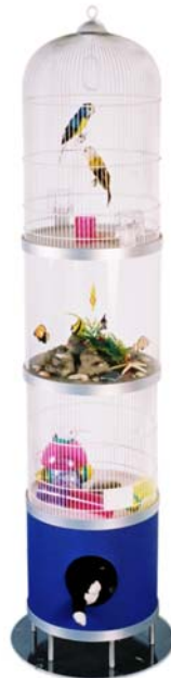
Prototype for « tour z'animé », season 1.

Fortified by the success of this initial experiment, IFA, in partnership with the Ministry of National Education, hoped to expand the venture by giving it a national dimension. Numerous schools all over France have already engaged in this innovative educational process which, thanks to an artistic and cultural project conducted in the classroom, permits access to fundamental knowledge but also to recognition of the pupils' sensitive intelligence, besides their rational intelligence. Businesses, designers and teams from VIA have joined with them in this superb project. This mobilisation has resulted in nearly 30 prototypes, which made up the exhibition that has just toured France.